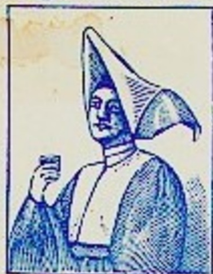
Nome e Marca Depositati